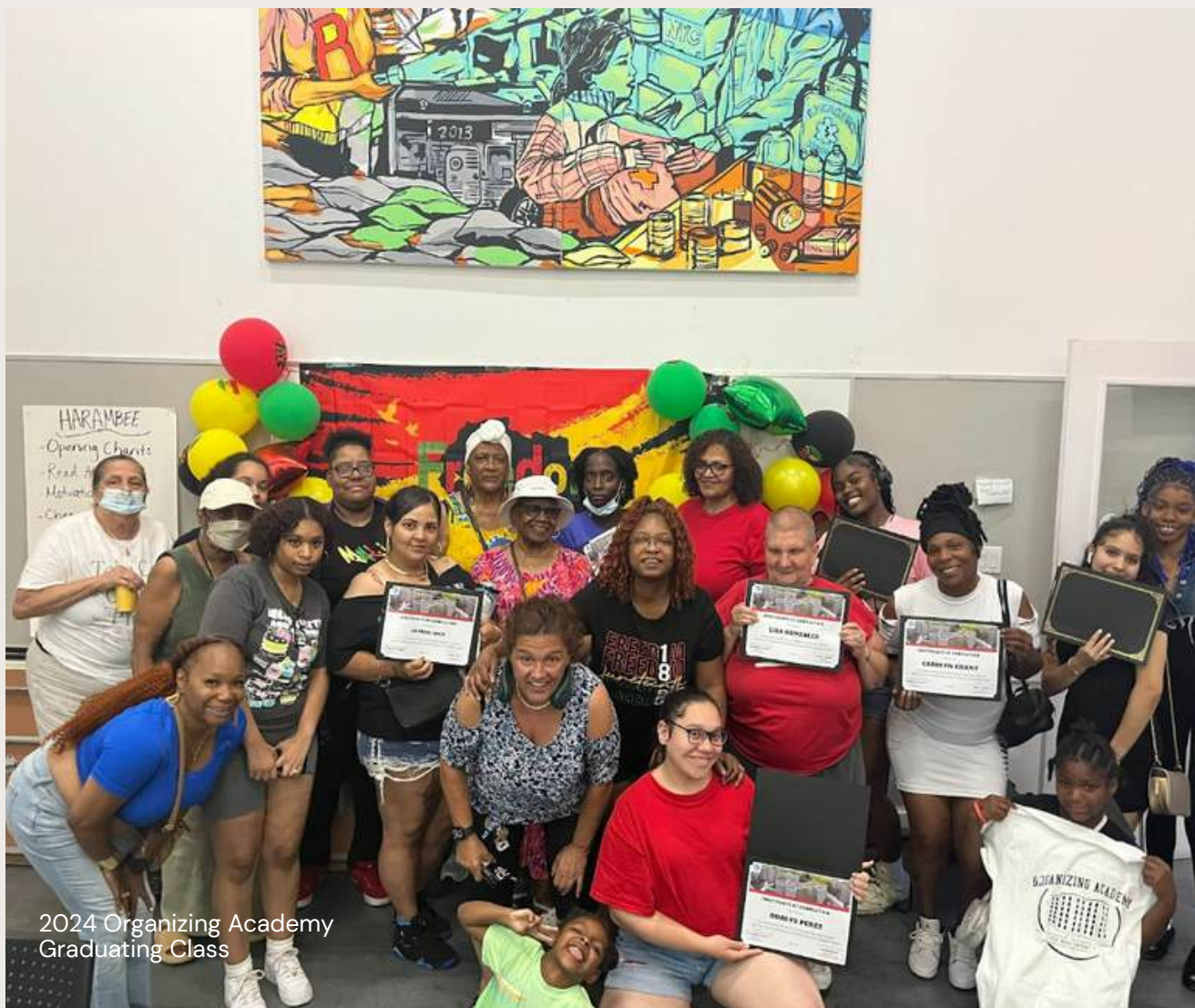
2024 Organizing Academy Graduating Class

RHI's Organizing Academy continued to serve as a pipeline into campaigns focused on public housing and environmental justice. This past year, 27 Red Hook residents graduated from our intergenerational leadership development training.