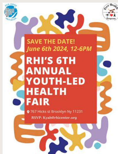
RHI's Youth-Led Health Fair