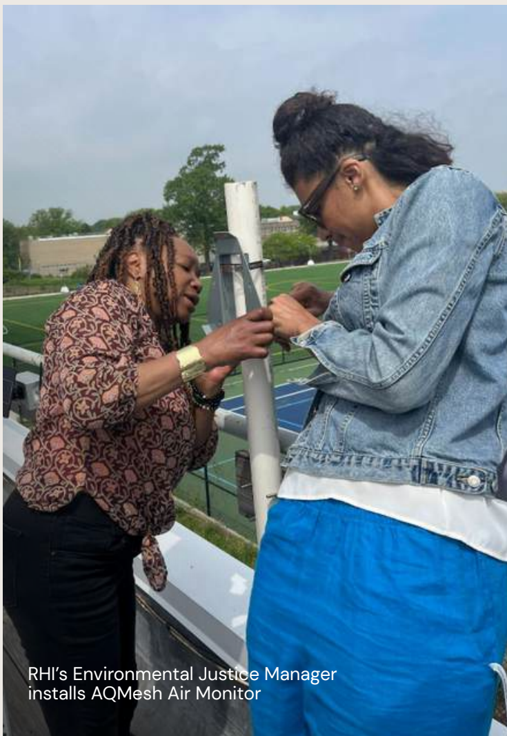
RHI's Environmental Justice Manager installs AQMesh Air Monitor

RHI launched the Red Hook Action for Clean Air initiative in response to the ongoing construction in the Red Hook Houses, rapid expansion of last mile distribution centers, and historical environmental injustices in Red Hook. The initiative builds the capacity of Red Hook Houses residents to measure, document, and interpret air quality issues and is developing an advocacy agenda to address air quality issues and implement strategies to mitigate environmental harms. In 2024, the initiative reached 143 residents through workshops and events, 23 middle school youth through in-school workshops, and 10 high school students through an intensive "Environmental Stewardship" summer camp. RHI trained two Young Adult Environmental Justice Fellows in partnership with CUNY Advanced Science Research Center.