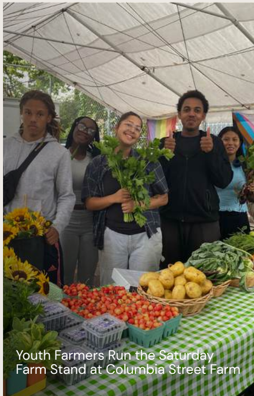
Youth Farmers Run the Saturday Farm Stand at Columbia Street Farm