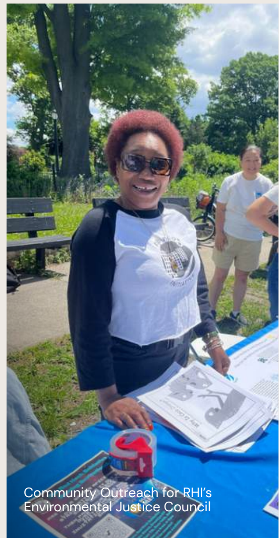
Community Outreach for RHI's Environmental Justice Council