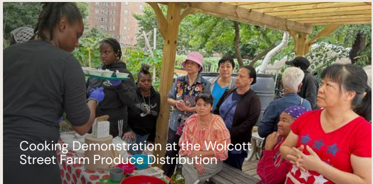
Cooking Demonstration at the Wolcott Street Farm Produce Distribution