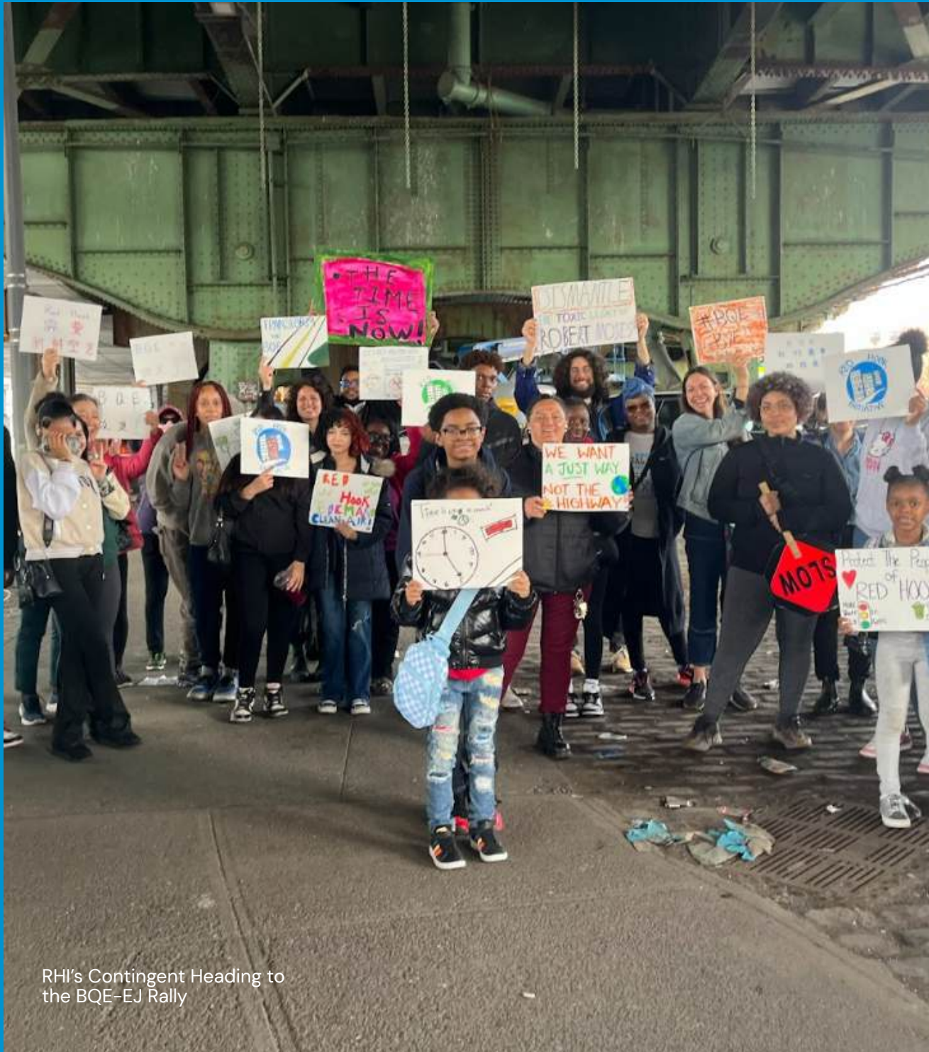
RHI's Contingent Heading to the BQE-EJ Rally

In 2024, as an active member of the Brooklyn-Queens Expressway-Environmental Justice coalition, RHI advocated for a comprehensive redesign process for the BQE that centers the marginalized communities most affected. RHI rallied for a transformation of the expressway to address the negative environmental and health impacts of the highway on communities, with a complete summary of our research documented in the "Ants Among Buffalo" report . The coalition's efforts are often covered in the media, recently in The Brooklyn Eagle .