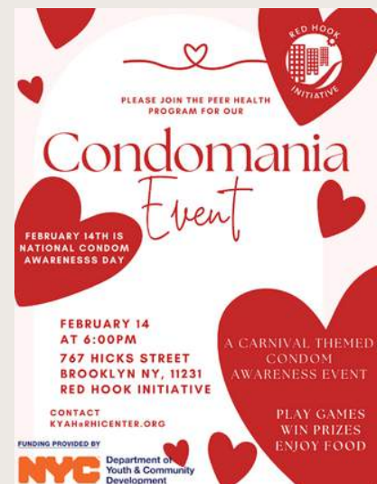
Peer Health Educators Condomania Event