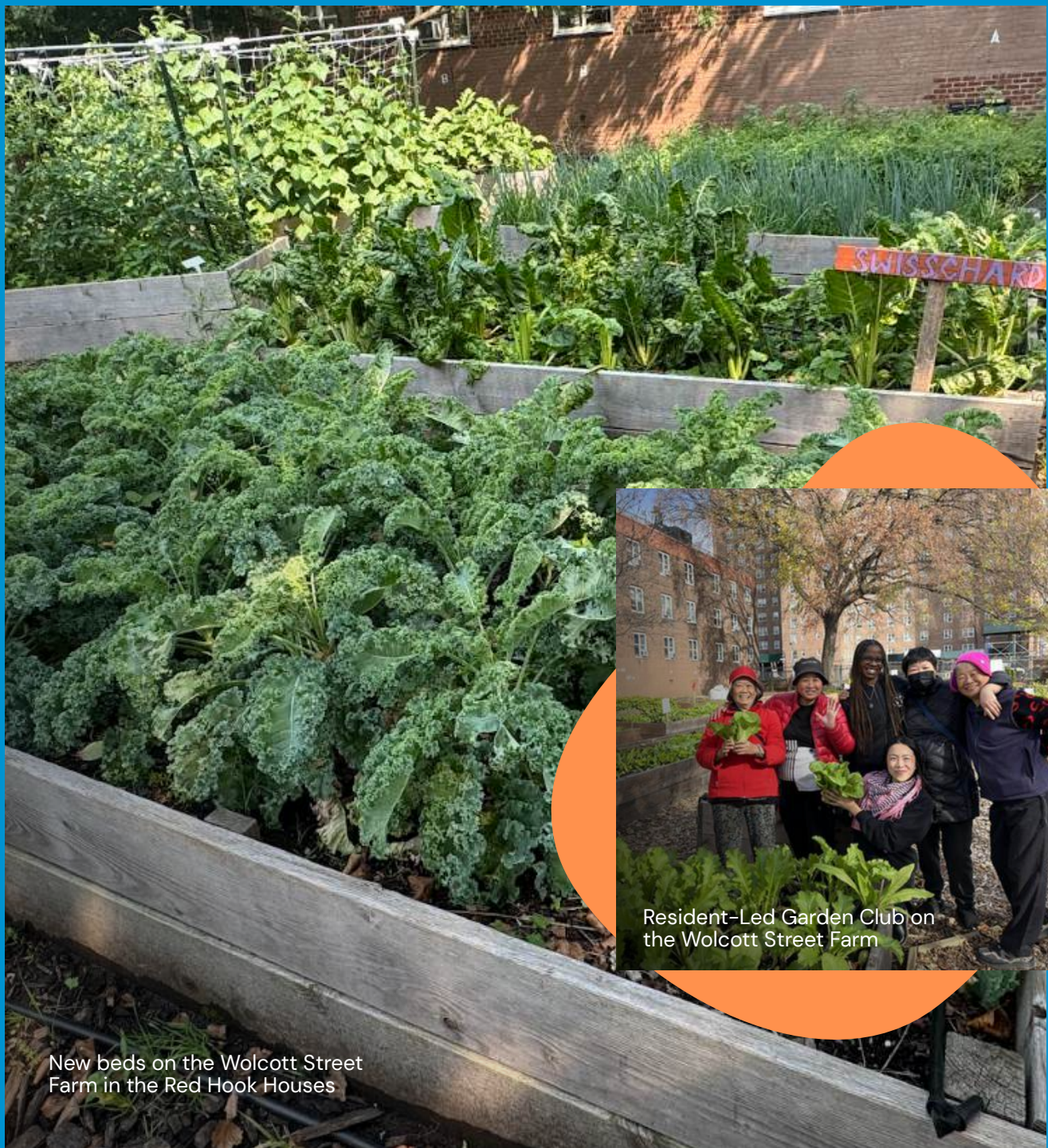
New beds on the Wolcott Street Farm in the Red Hook Houses

The farm is already bridging Red Hook's diverse communities. Our new Garden Club brought 10 resident farmers who speak different languages (English, Spanish, Cantonese and Mandarin) to the farm around a shared interest in food and nutrition. Each member tended their own plot in a newly-built bed at the Wolcott Street Farm.