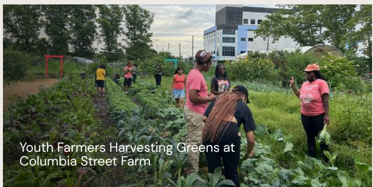
Youth Farmers Harvesting Greens at Columbia Street Farm