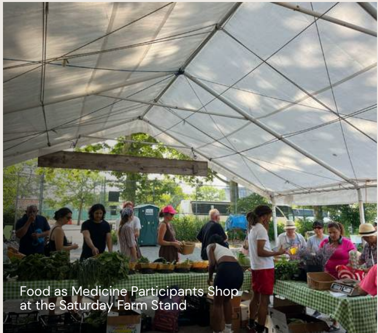
Food as Medicine Participants Shop at the Saturday Farm Stand

"I've been eating more vegetables... my habits are different now. Before, I used to eat my rice and beans, and that's it. Now I have to have cabbage or cucumber or lettuce, tomatoes on the side. I never did that before."