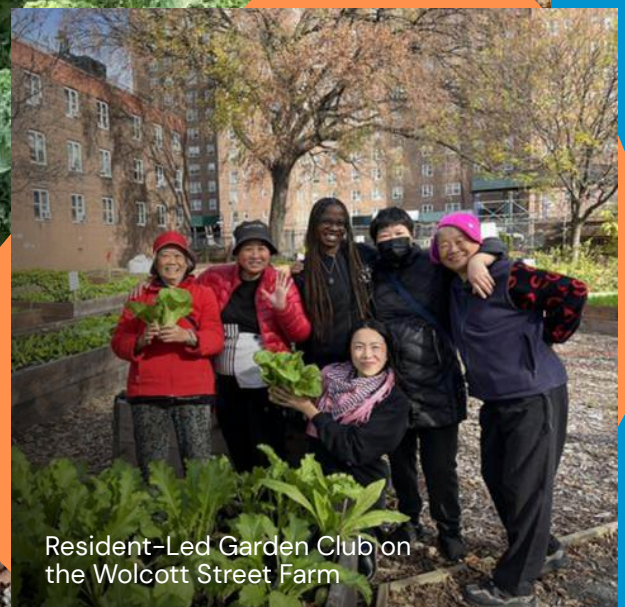
Resident-Led Garden Club on the Wolcott Street Farm