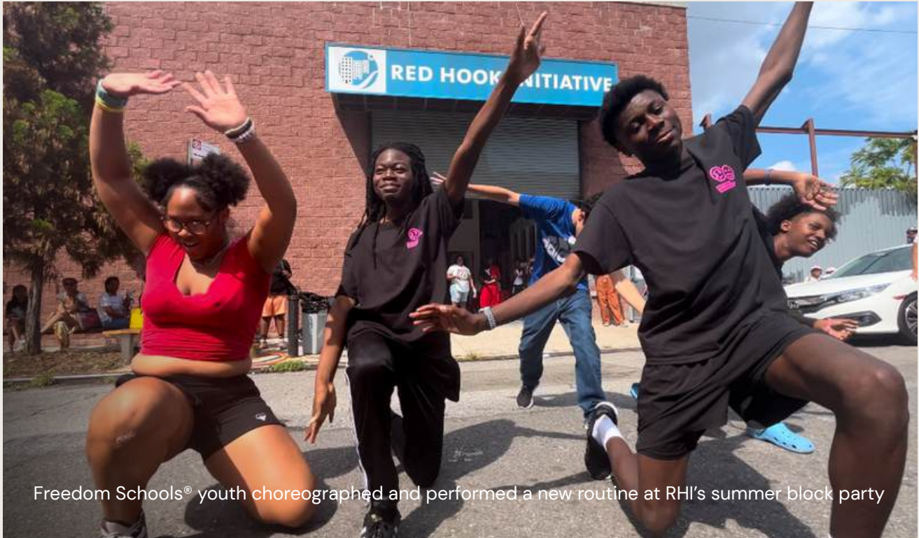
Freedom Schools® youth choreographed and performed a new routine at RHI's summer block party

At RHI, arts-based healing programs in dance, visual arts, and poetry inspire youth to heal from trauma and build resilience. This past year, dance classes encouraged students to work collaboratively, evaluate personal behavior as it reflects on self and others, and make decisions both personally and as a community that promote empathy and optimism. In visual arts programs, young people explored art as a means of expression and healing, while building community amongst their peers.