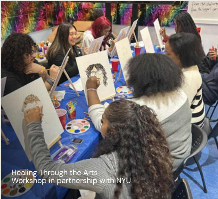
Healing Through the Arts Workshop in partnership with NYU